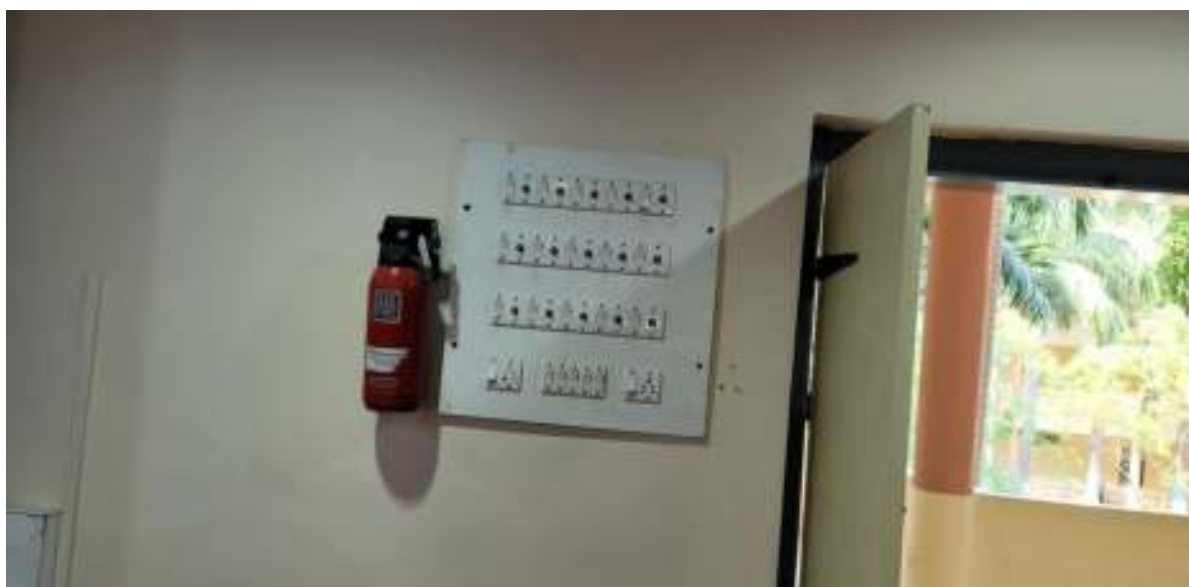
Fire extinguishers available in whole campus